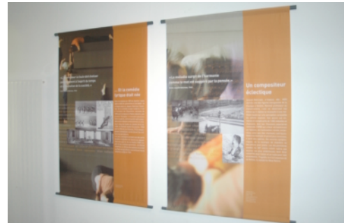
Section n° 2: An eclectic composer