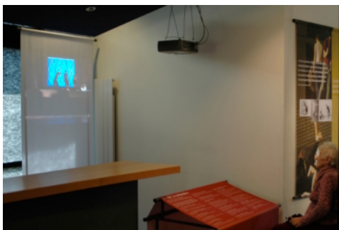
Panel 10 and projection